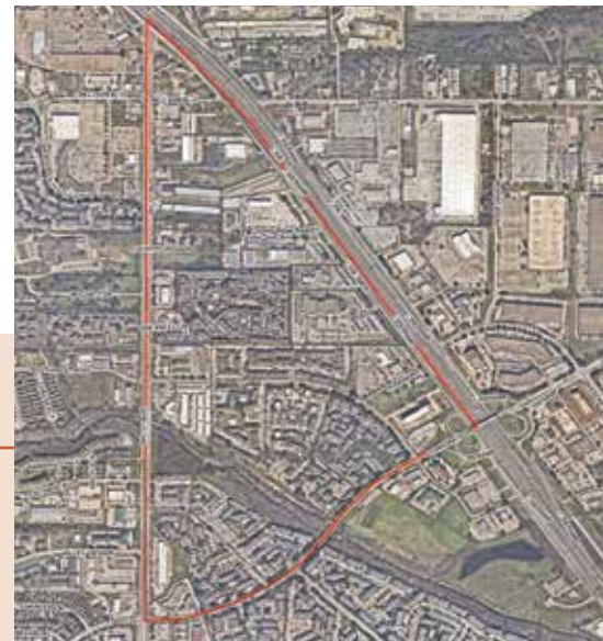
CITY OF LEWISVILLE

The study area, known locally as the Triangle, is bordered by three major roadways: Business 121, Interstate 35, and Corporate Drive. Commercial corridors surround a large part of the study area and prevent safe and walkable access to natural open spaces, schools, and homes, presenting challenges in achieving connectivity and cohesion. Families in the Triangle live primarily in multifamily residences and have a median income that is almost $15,000 less than other households in Lewisville. Ownership of property in the area is dominated by commercial businesses and absentee property owners. Residents are perceived to be transient, making meaningful community engagement difficult.